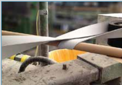
SG333 Gray Tube Winder