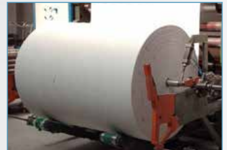
SG411Y Unwind Belts