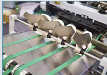
SG21A Sheeter Belts