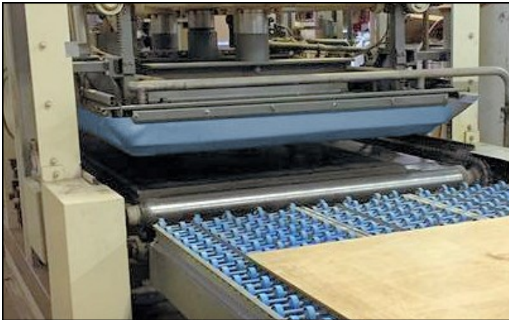
VACUUM MEMBRANE PRESS

Shingle Belting's SILCO silicone membranes for 3D lamination and vacuum forming