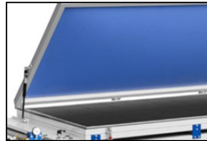
VACUUM FORMING PRESS